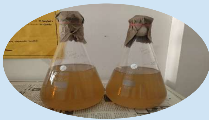
Pochonia chlamydosporia culture - disc inoculation for formulation preparation